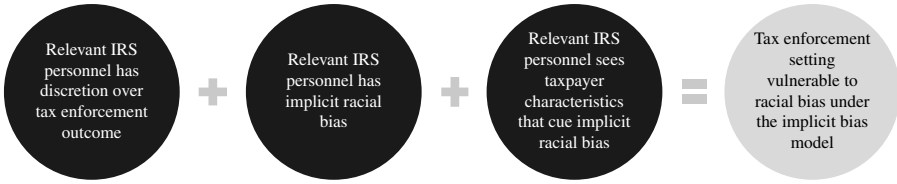
FIGURE 2. IMPLICIT BIAS MODEL OF TAX ENFORCEMENT

Because implicit bias is generally more common amongst individuals than racial animus, there is a much broader set of potential tax enforcement activities that could be affected by implicit bias. In other words, a greater number of IRS personnel may act on implicit racial bias than on racial animus, in turn affecting a greater number of tax enforcement activities, even though both forms of bias are possible in the same enforcement settings. The literature on implicit bias outside of the tax context has also noted how the harms of implicit bias may in some respects be worse because individuals who are unconscious of their biases do not self-correct. 104