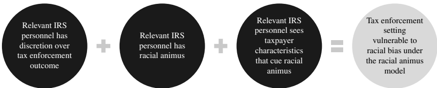
FIGURE 1. RACIAL ANIMUS MODEL OF TAX ENFORCEMENT

Deploying the racial animus model in the context of tax enforcement would require the following elements for racially biased tax enforcement to be possible. First, the relevant IRS personnel would need to have racial animus, defined as a negative attitude towards a specific racial group that a taxpayer is a member of. Second, the relevant IRS personnel would need access to information that allows the personnel to identify the taxpayer's race or ethnicity. 86 Finally, the relevant IRS personnel would need to have some level of discretion over the tax enforcement outcome of the taxpayer.